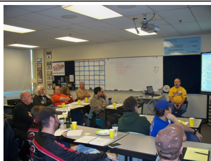
Our mentors along with other teams, busy at work with Team RUSH

This event gave mentors from several teams an opportunity to toss around different ideas on running teams.